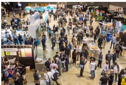
Horncastle Arena – Exhibition Hall