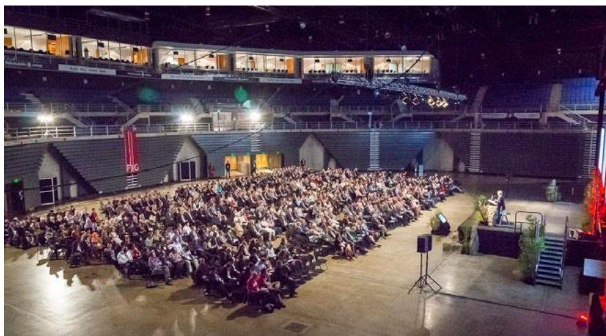
Plenary Session 1 at Horncastle Arena, 3 May