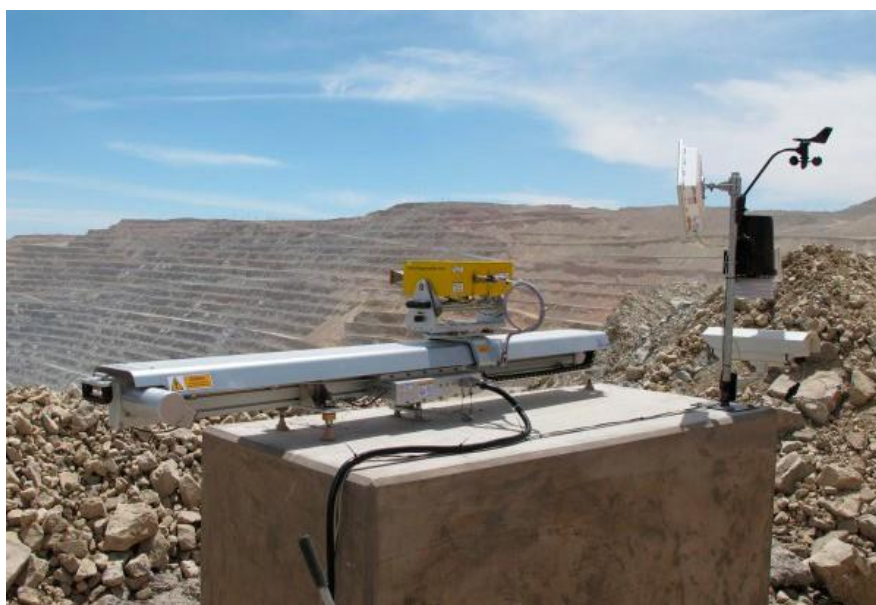
Image: IDS's IBIS-FM radar unit

On the topic of multi-constellation GNSS, China’s Beidou successfully launched its 22nd satellite on 30 March, and remains on schedule for Beidou to be fully operational as a global system by 2020. The EU’s Galileo system has the launches of its 13th and 14th satellites planned for May, with 18 Galileo satellites due to be in orbit by the end of 2016 - only 13 years behind schedule and 3 times over budget, as described in a recent Spatial Source article: http://www.spatialsource.com.au/2016/02/16/galileo-over-budget-13-years-behind-schedule/ . The Indian Regional Navigation Satellite System (IRNSS) also launched another satellite in March, and now has 6 satellites in orbit (although this system is of little benefit to GNSS users in NZ). Add these to the 30 GPS satellites, the 26 GLONASS satellites, and a lonely QZSS satellite and that’s a total of nearly 100 navigation system satellites and growing. And while not all these GNSS satellites pass over NZ skies, it does demonstrate an under-utilisation of available GNSS signals if persisting with legacy GPS-only receivers.