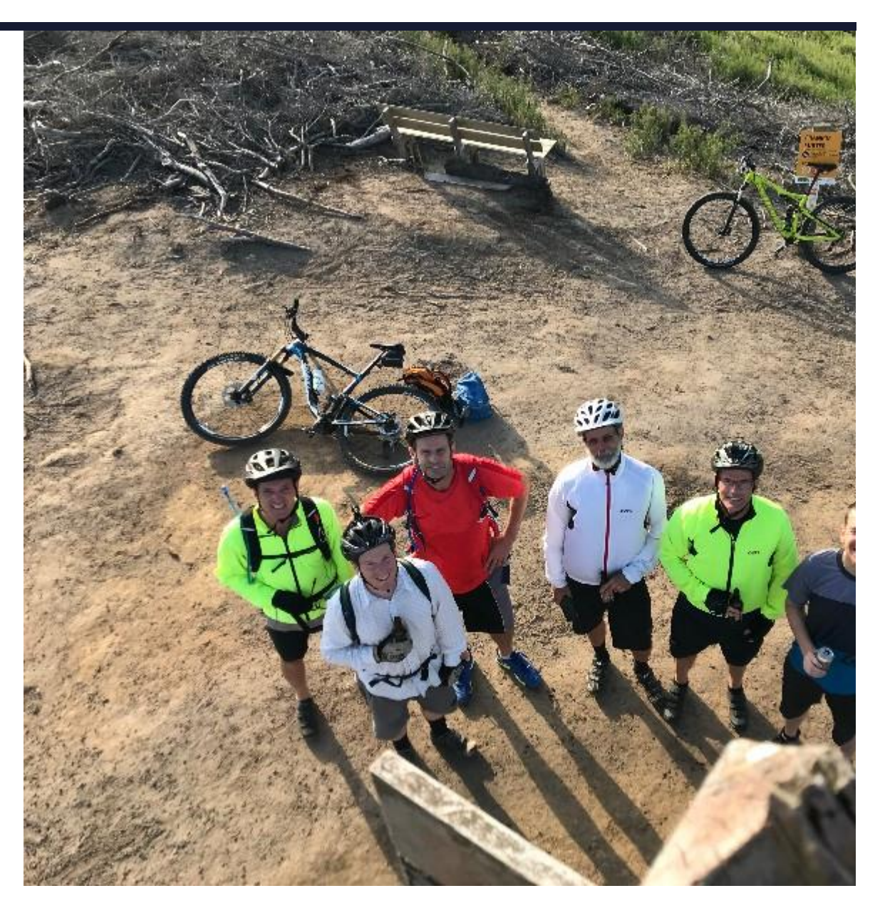
Rotorua/BOP branch members celebrating their efforts.

Students, staff and alumni of Otago Survey School got into demystifying what they do at the Octagon with theodolites and a total station.