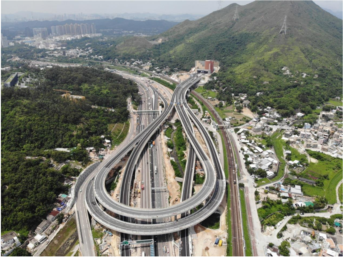
Lian Tang Project